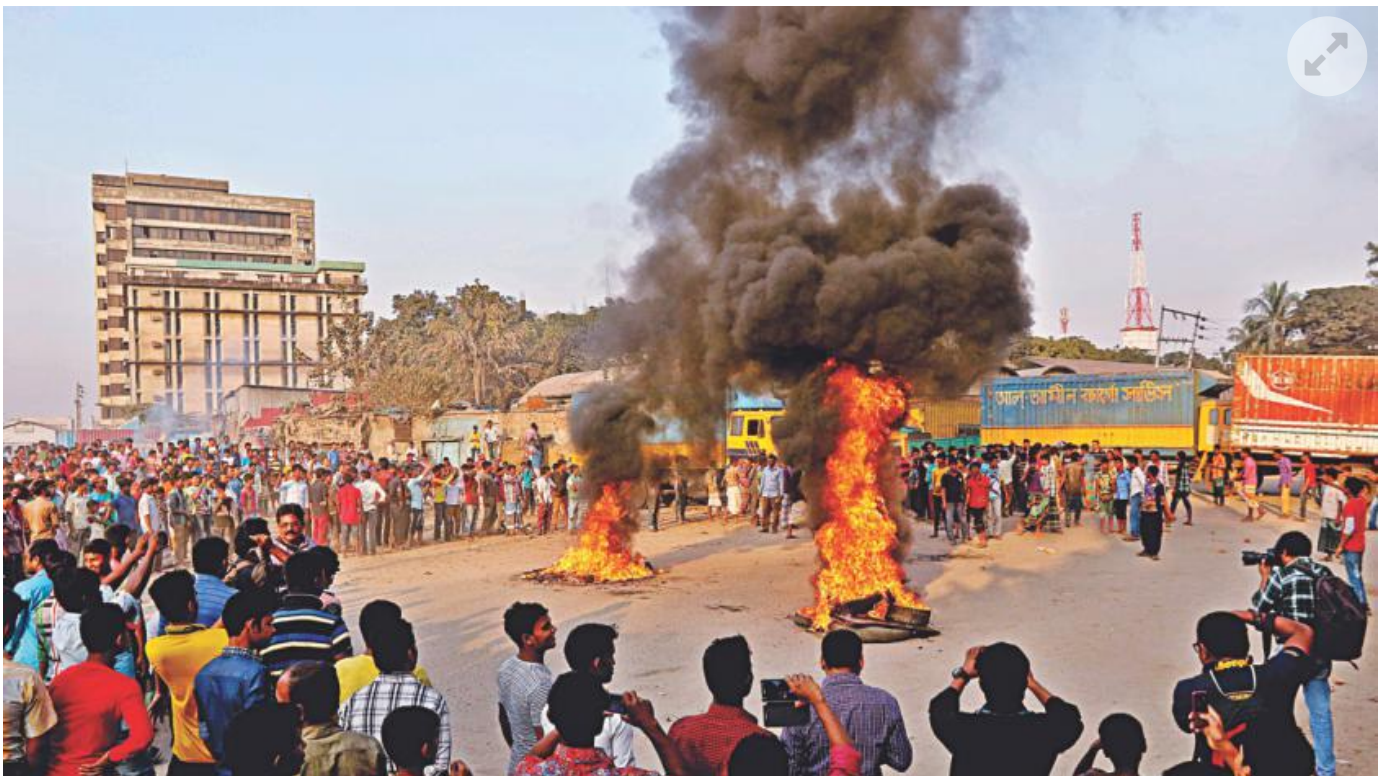
Transport workers burn tyres to block a street near the Tejgaon Truck Terminal in the capital on November 29, 2015, protesting an eviction drive against illegal structures.

In the end he came out of his confinement making some empty roars. We now wait to see if he can do what he took up as his task. This may well be his litmus taste because if he has to put Dhaka in order he may well have to face many more similar incidents.